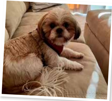
Meagan Warner's dog Jack is just too cute for words.